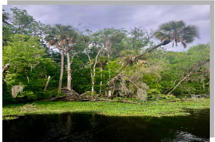
St Johns River

Well I hope you enjoyed this virtual trip along the St Johns that will wrap up another adventure along the Florida Black Bear National Scenic Byway.