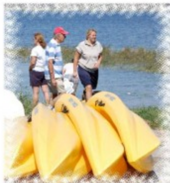
The water activities were popular with guests.

Smoky Bear poses with two fellow US Forest Service fire fighters.