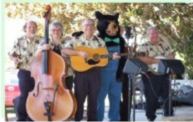
Liberty the 4-H Bear joins in with Woods & Bridges Bluegrass for some great musical entertainment.