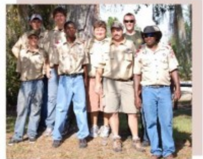
Umatilla Boy Scout Troop 253 worked hard all day directing parking.